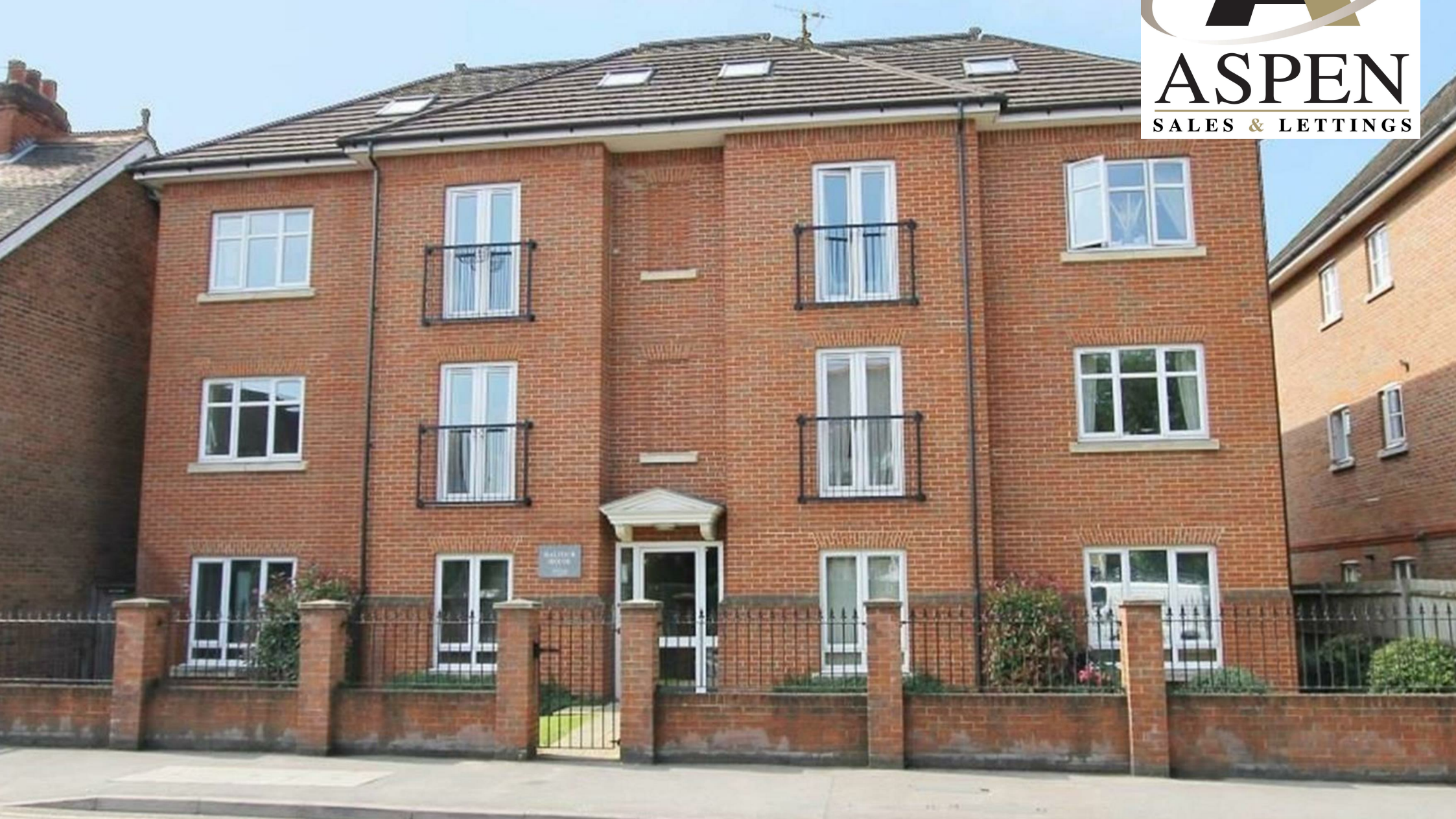
4 Balfour House Balfour Road, Weybridge, KT13 8HE